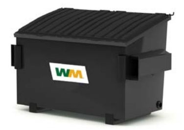
Do Not Include:

Organics/Recyclables Hazardous Waste Electronics Aerosol Cans Batteries, Tires or Paint Flammable Material